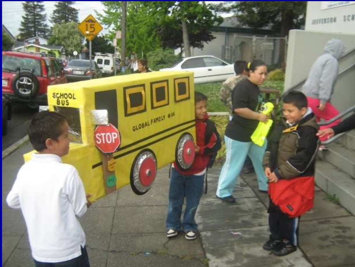
Walking School Bus, Global Family School