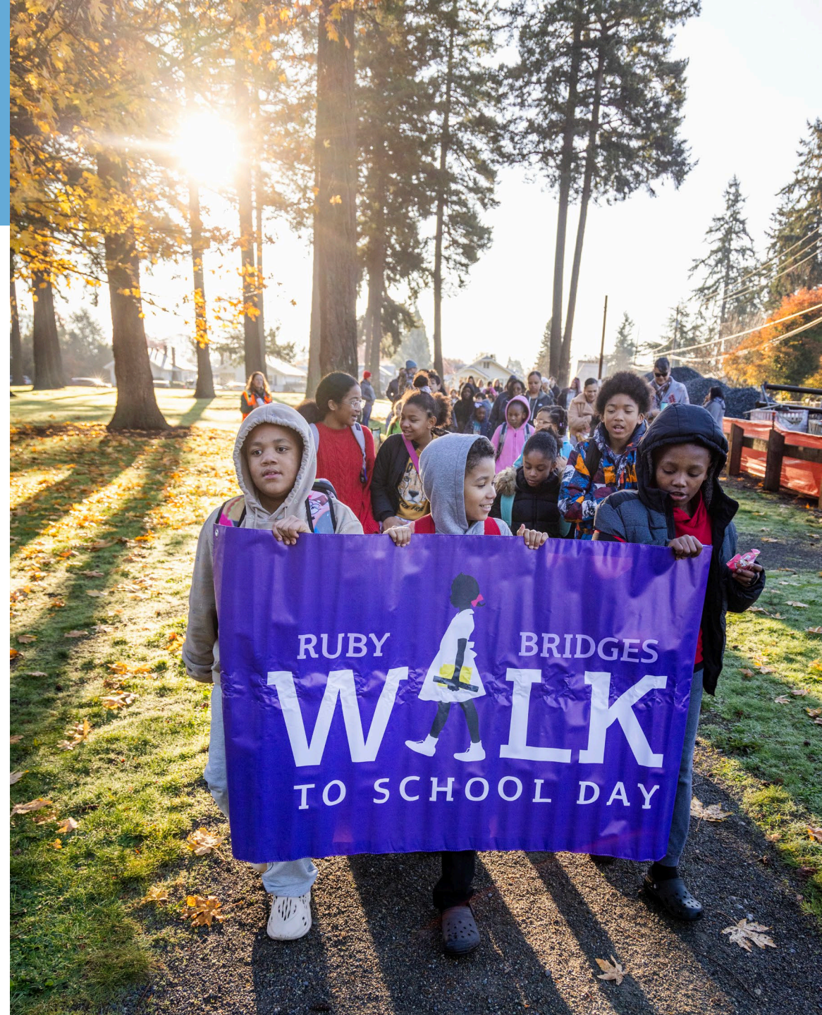
Image shows a group of 40+ students walking in a local park along a walking trail with the front three students holding up the Ruby Bridges Walk to School day banner