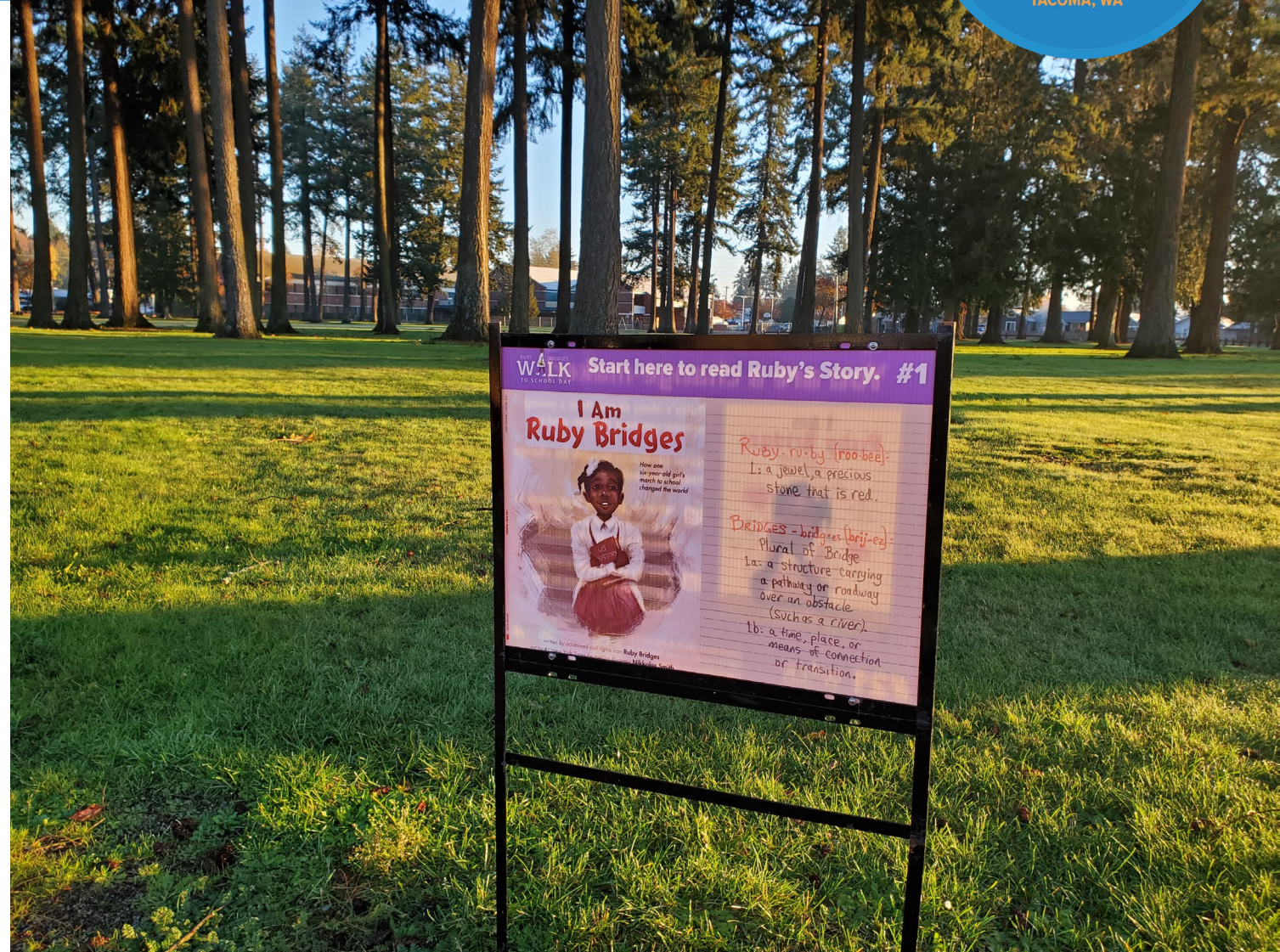
Image shows the first of the Ruby Bridges Story Walk signs with the first two pages of her book. The sign also says, "Start here to read Ruby's story."