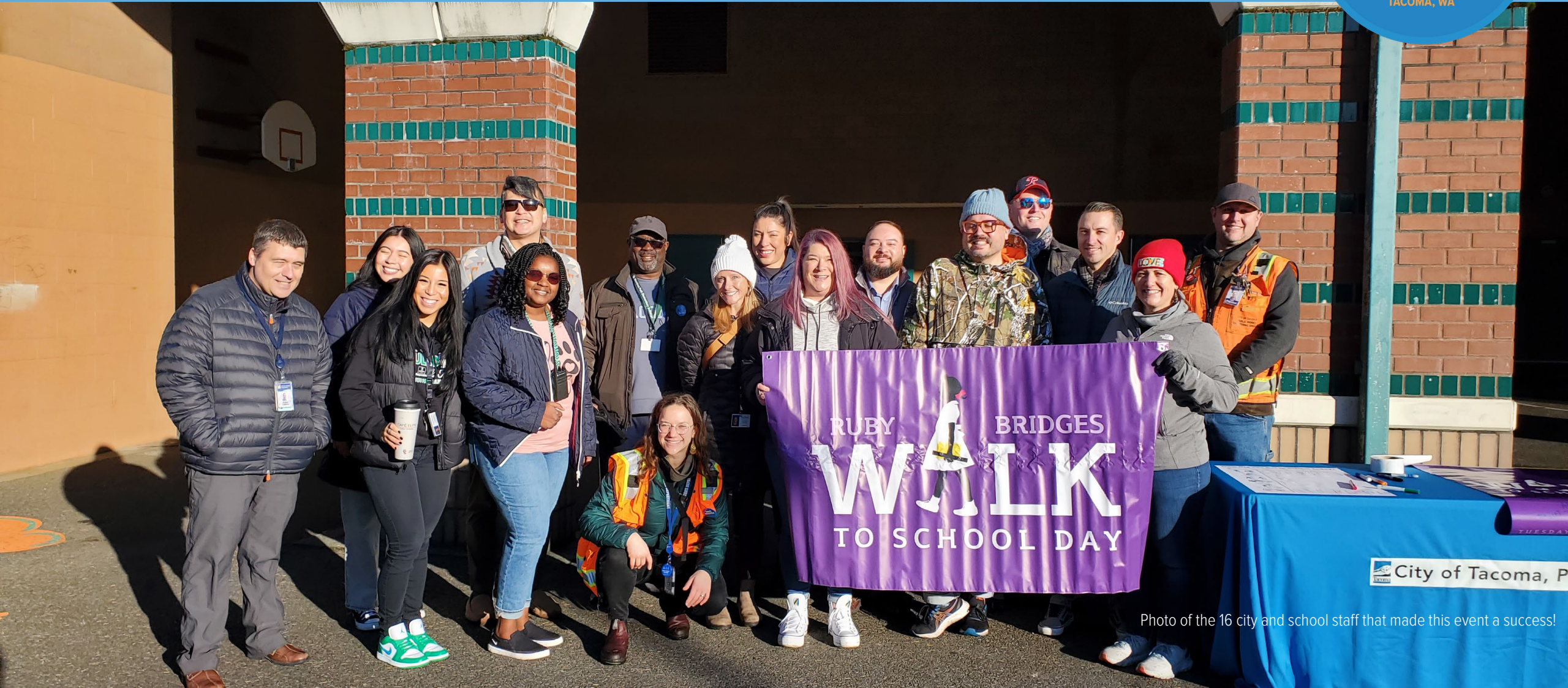
Photo of the 16 city and school staff that made this event a success!