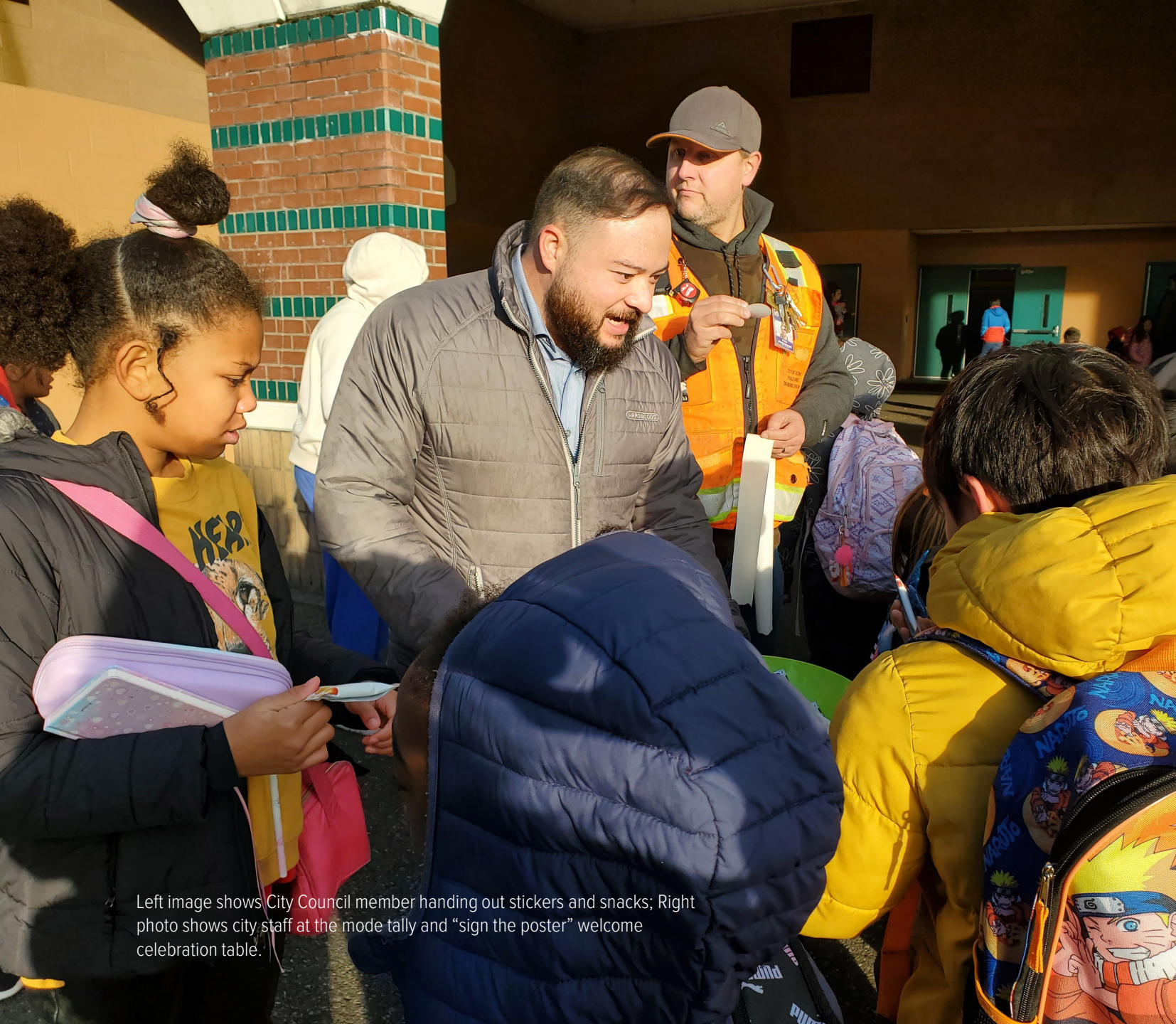
Left image shows City Council member handing out stickers and snacks; Right photo shows city staff at the mode tally and “sign the poster” welcome celebration table.