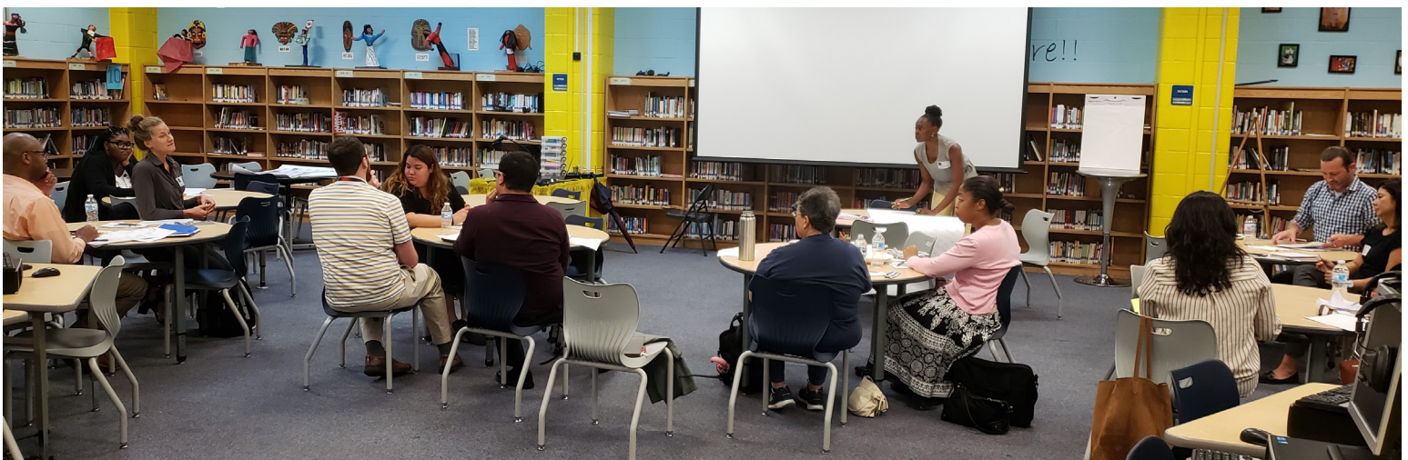
CAN DO Houston hosted a meeting with various partner organizations to coordinate efforts around improving safety, walkability, park access, and infrastructure in the Near Northside community.