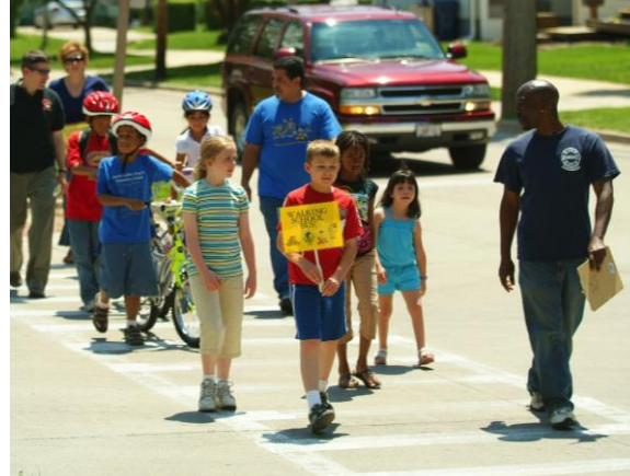
Education, Training, and Capacity Building