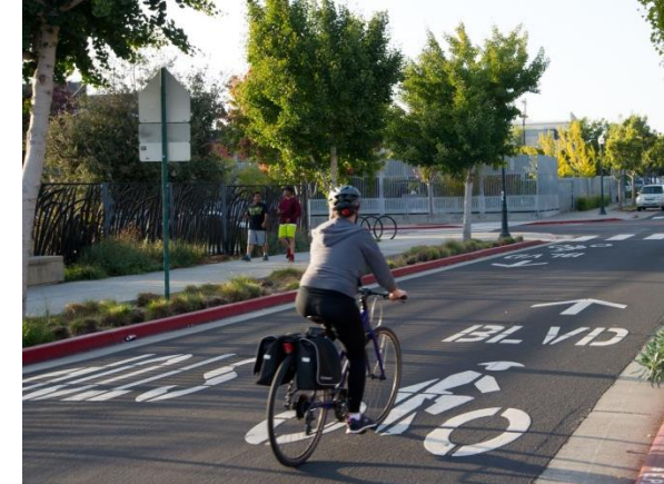
Community Engagement and Coalition Development