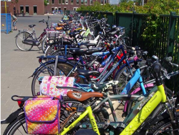
Policies and Plans