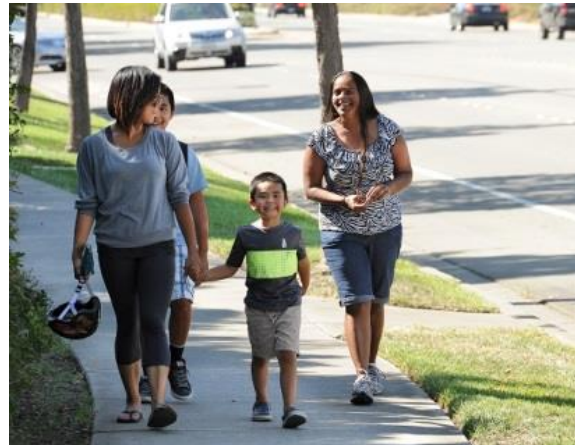
Research and Analysis