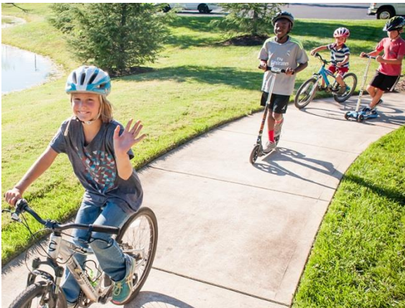
Program Planning and Implementation