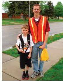
teen. I walk the kids to school then get to work. It is a win-win situation for the kids and me. I even talk to the kids and